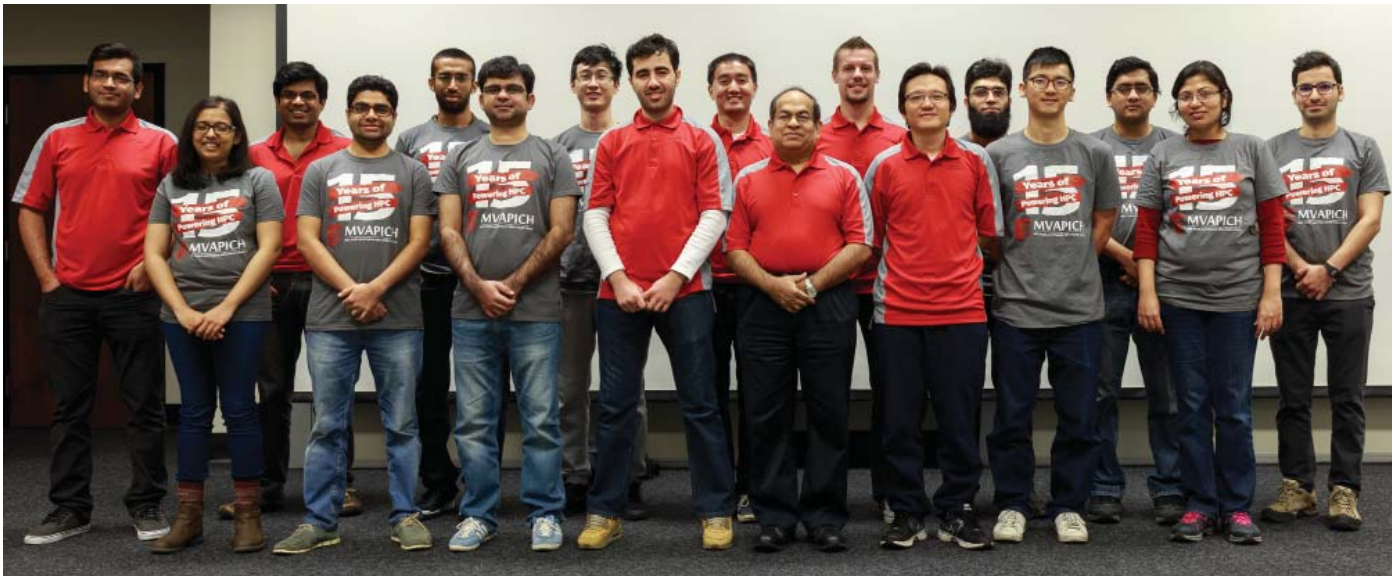
Pictured above left to right